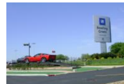
Bowling Green Assembly Plant

jameswood.com 940-591-9663 972-434-1515 Exit 462 off I-35E South, DENTON