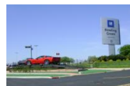
Bowling Green Assembly Plant

Except for the American woman, nothing interests the eye of the American man more than an automobile, or seems so important to him as an object of aesthetic appreciation. ~ Alfred Hamilton Barr, Jr., first director of the Museum of Modern Art, New York.