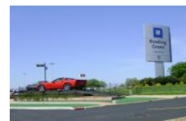
Bowling Green Assembly Plant