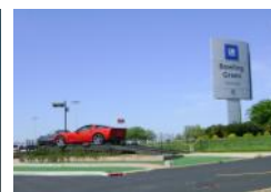
Bowling Green Assembly Plant