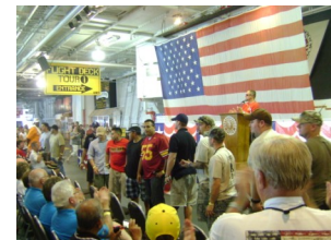
Veterans who have benefited from the Wounded Warriors Project