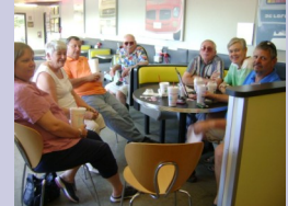
Sundae Cruise from Good Eats to Sonic – 2.4 miles